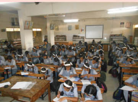
Rajrshi Shahu Maharaj Primary School, Mundhwa, Pune