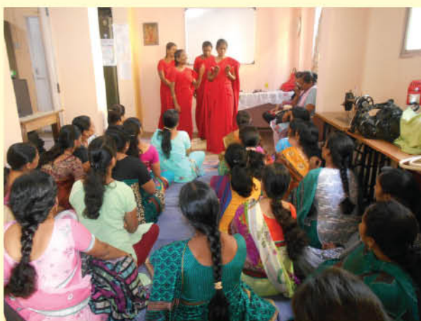
HIV & AIDS Awareness Program