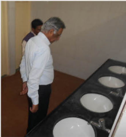
Mission - sanitation of schools CMD monitors the work done

Bharat Forge not only restricts its CSR initiatives to its home areas, but also extends support (providing help for infrastructural development) to other government schools like Shri. Sidhhrameshwara Vidyapeetha, Koppal & Shri Manjunatha Shikshan College, Yelburga, Kopal in Karnataka.