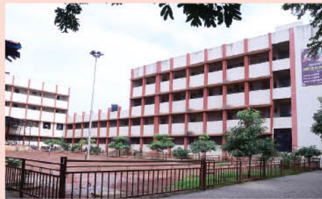
Z.P. Primary School Bhoivasti, Keshavnagar