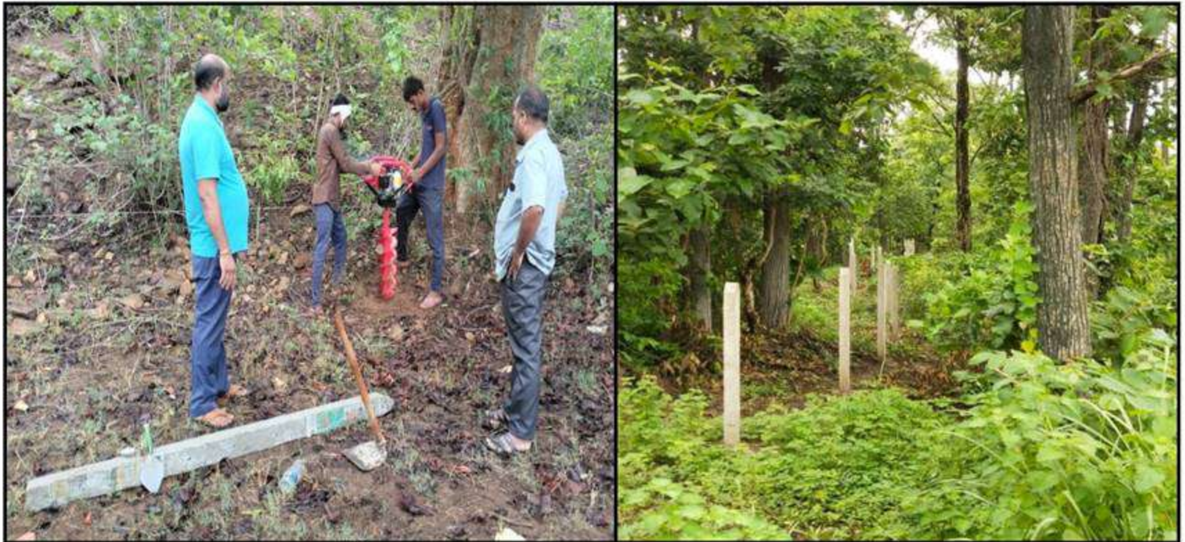
Barbed wire fencing