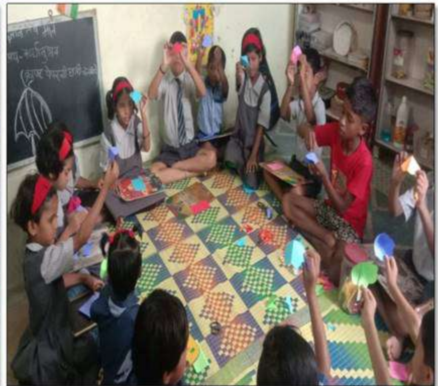
Craft making activity by students