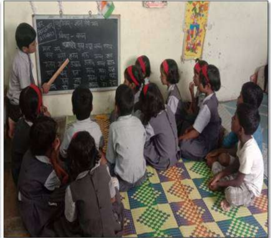
Students performing educational activities