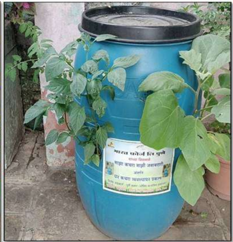
Few glimpses from last year's installed Composter Planters