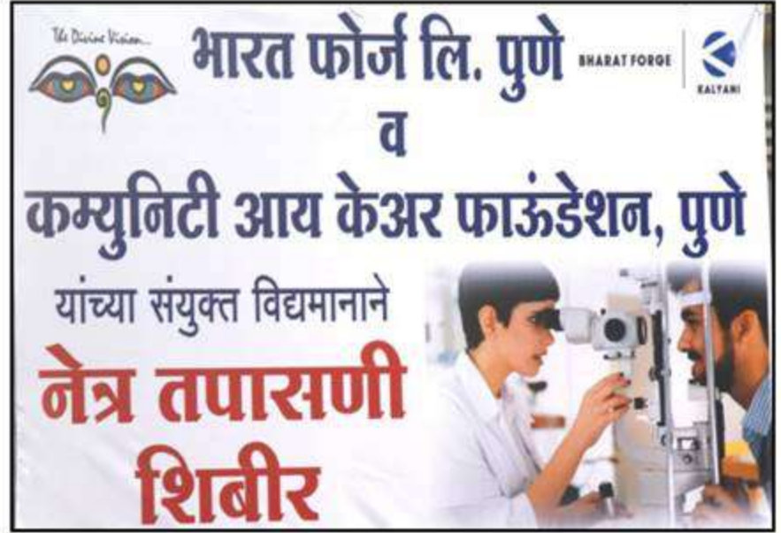
Eye checkup camp at Vadgaonsheri