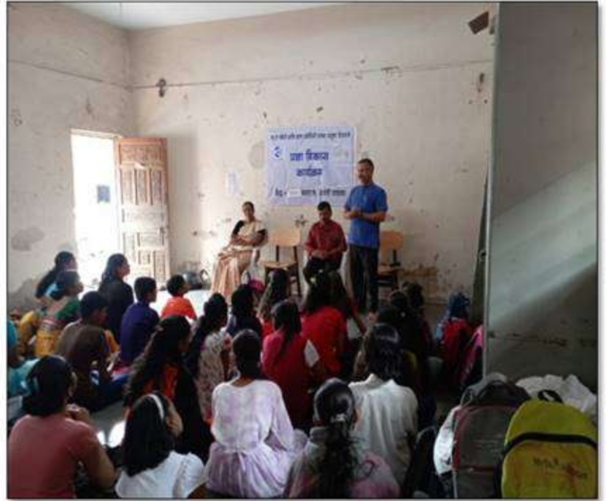
Parents meeting at different centers