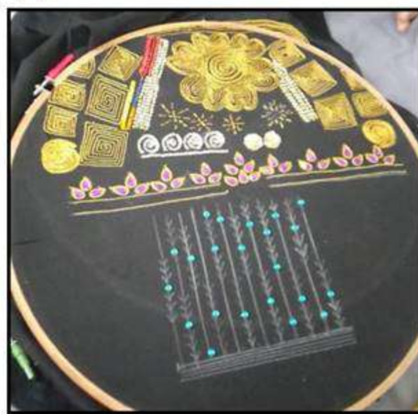
Different Designs of Ari work (Embroidery )