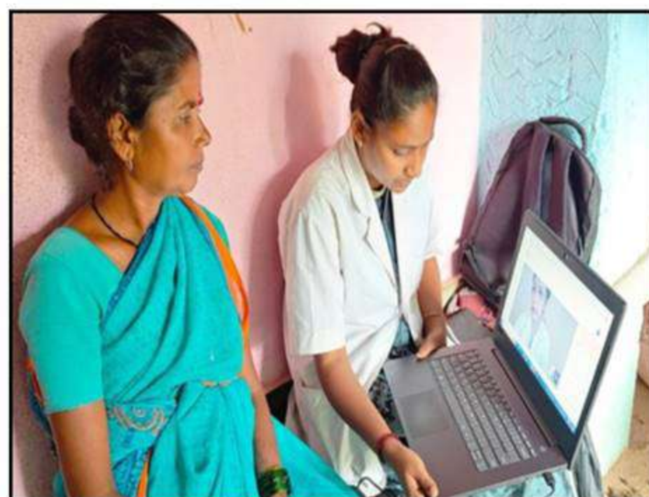
Online Tele consultation