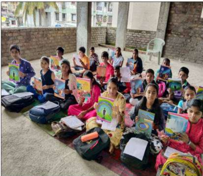
Education material distribution