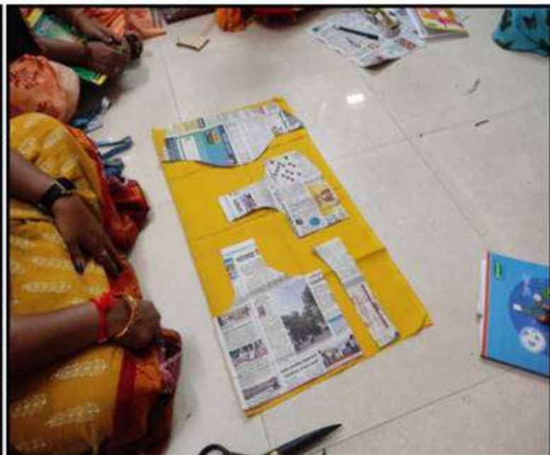
Basics of the stitching and cutting