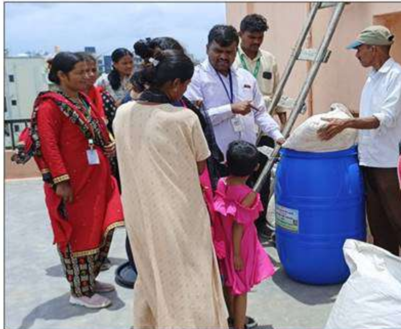
Installation of new Composter Planters