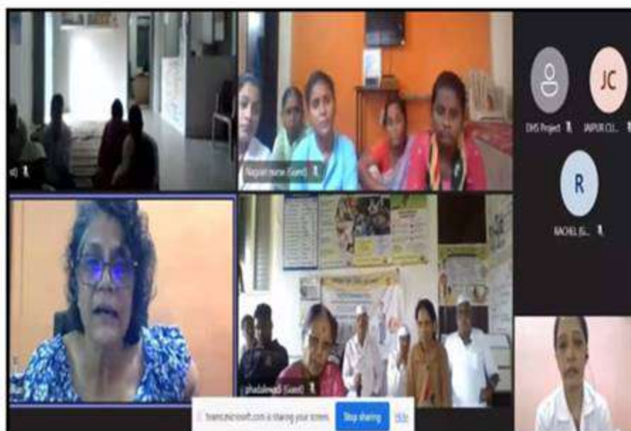
Villagers attending the online session