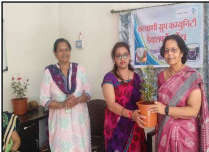
Inauguration of training program