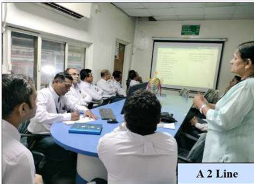
A 2 Line