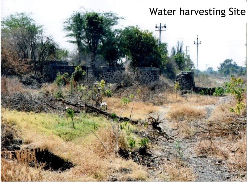
Water harvesting Site visit at Vadgaon Gupta