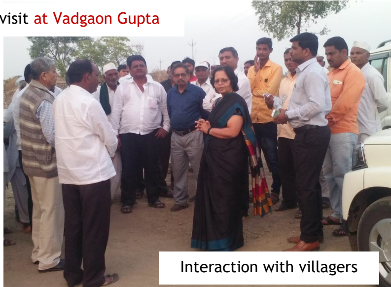
Interaction with villagers