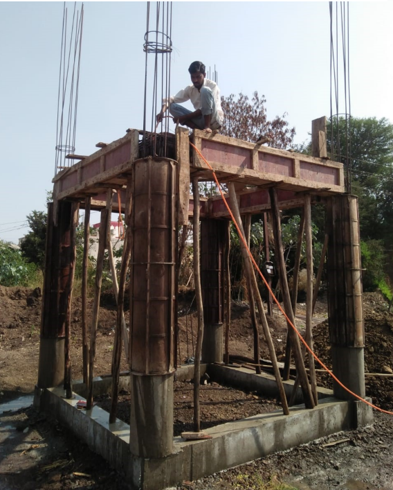
Water Tank Construction at Nigadi