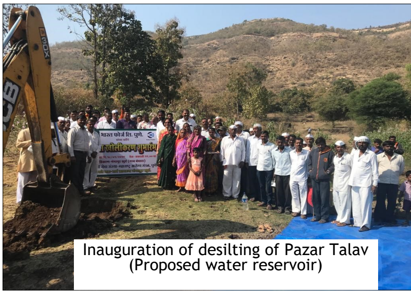
Inauguration of desilting of Pazar Talav (Proposed water reservoir)