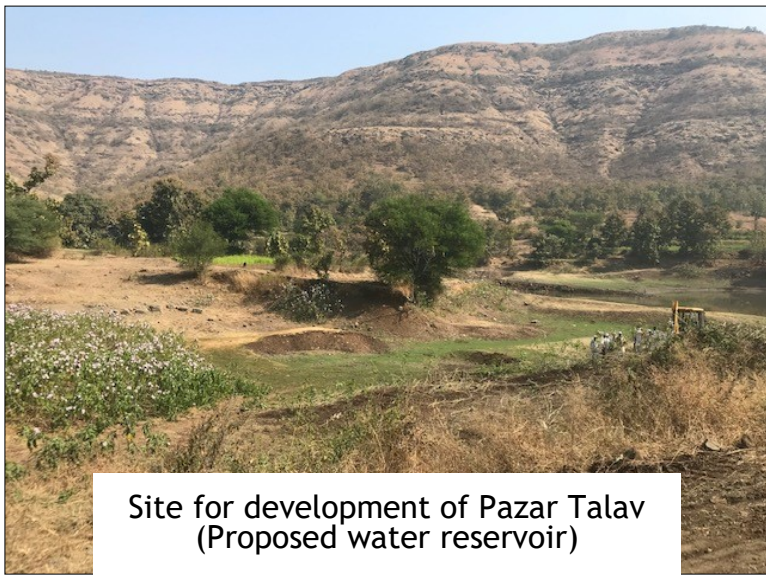
Site for development of Pazar Talav (Proposed water reservoir)