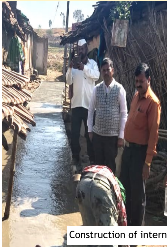
Construction of internal roads at Thakarwadi