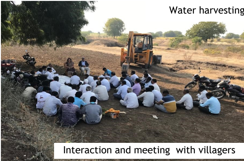
Interaction and meeting with villagers