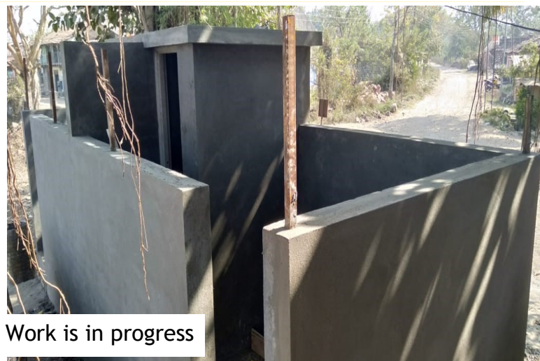
Toilet construction Work is in progress