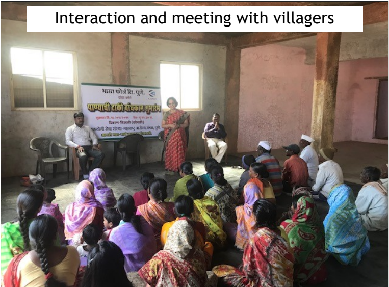
Interaction and meeting with villagers