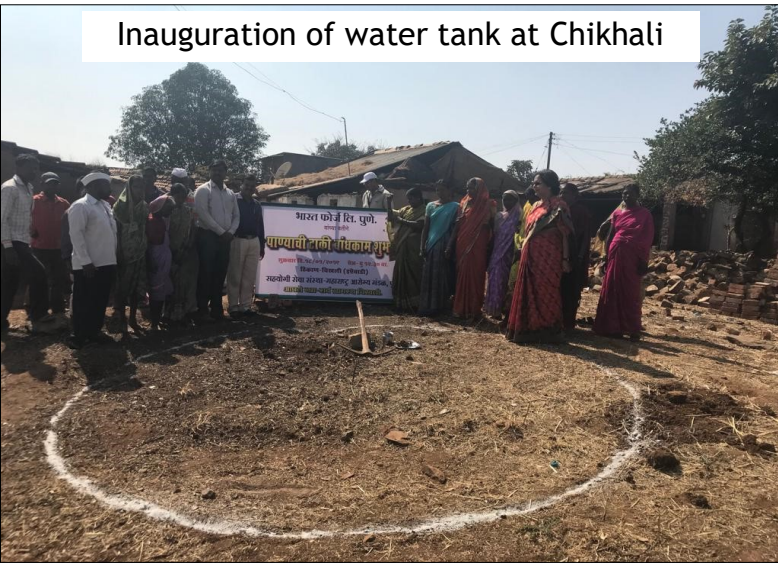
Inauguration of water tank at Chikhali