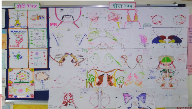
Making art through using Thread & Lady finger