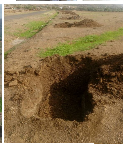
Meeting at Thakarwadi & Numberwadi, taluka Ambegaon for digging work.