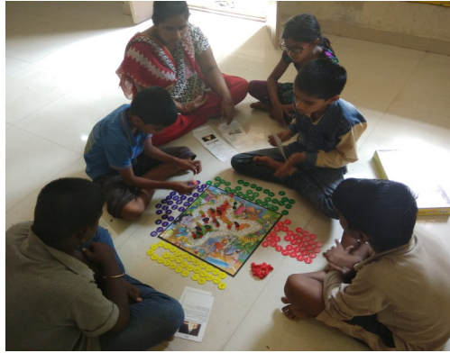
Fun learning game—to learn History & Geography