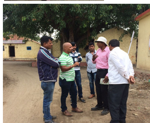
To plant suitable Trees at Kalewadi & Pawarwadi villagers had taken expert advice.