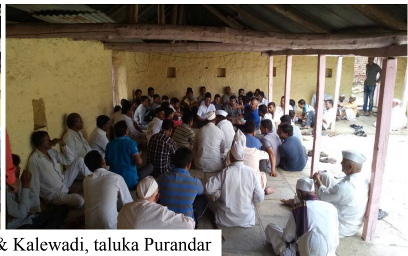
Meeting at Pawarwadi & Kalewadi, taluka Purandar