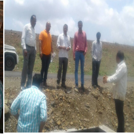
Meeting with the villagers & the concerned government officers