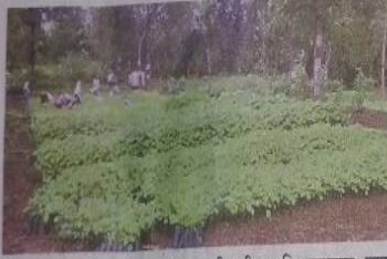
डिंबे (ता. आंबेगाव) : वृक्षलागवडीसाठी वनविभागाकडून तयार करण्यात आलेली रोपवार्डिका.