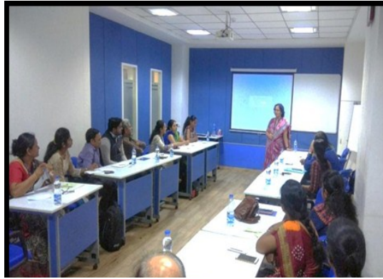
Explaining the objectives of the meeting