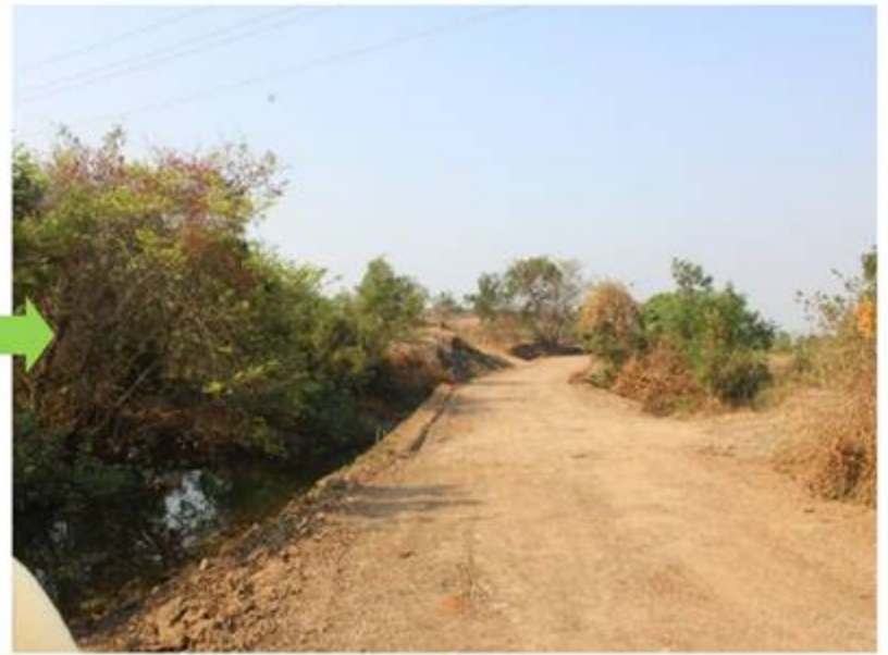
Construction of Panand Road at Nigadi