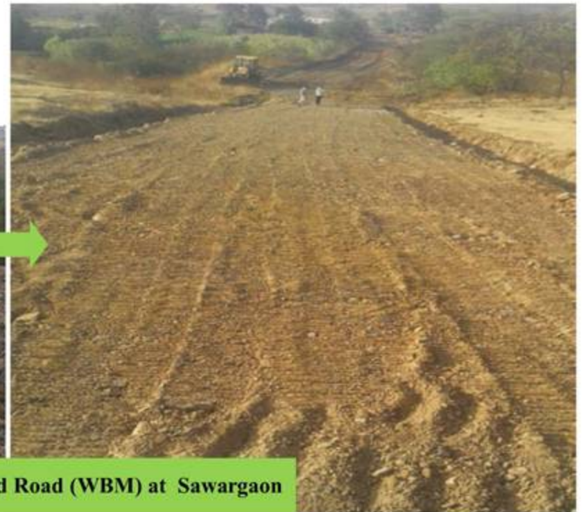
Construction of Panand Road (WBM) at Sawargaon