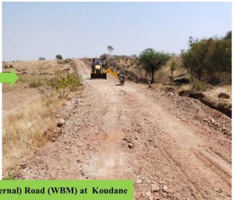
Construction of Panand (internal) Road (WBM) at Koudane