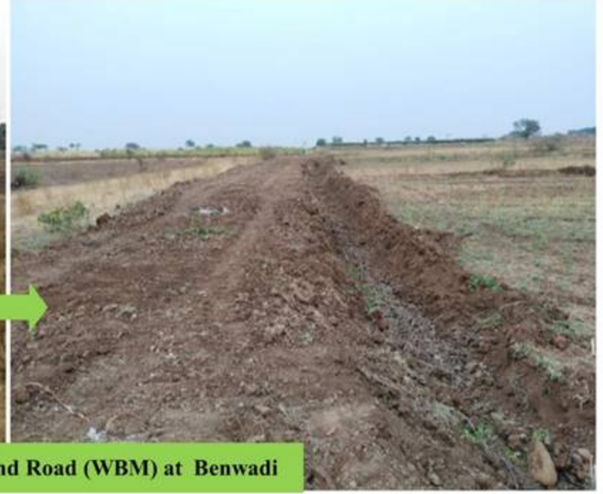
Construction of Panand Road (WBM) at Benwadi