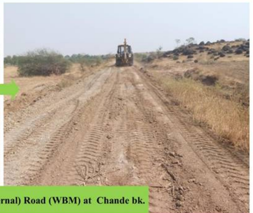
Construction of Panand (internal) Road (WBM) at Chande bk.