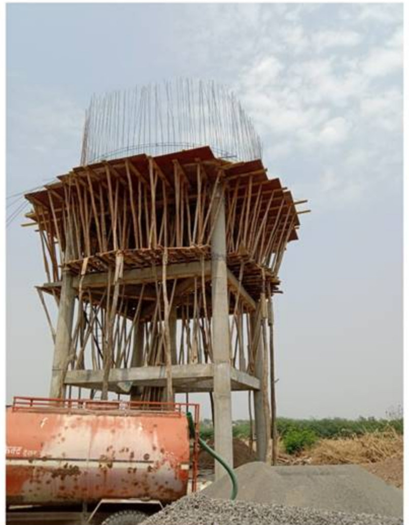
Construction of drinking water tank at Gondawale