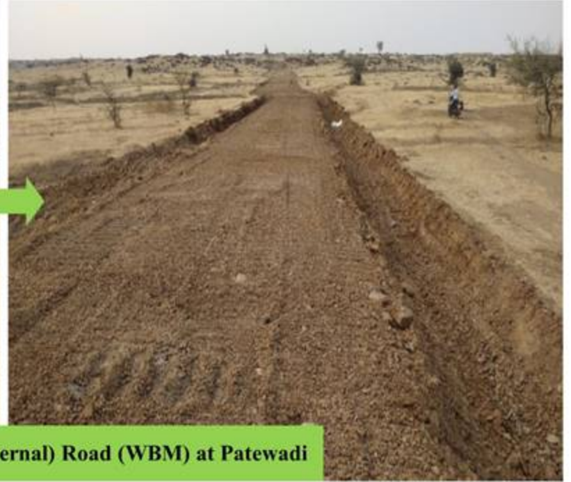
Construction of Panand (internal) Road (WBM) at Patewadi