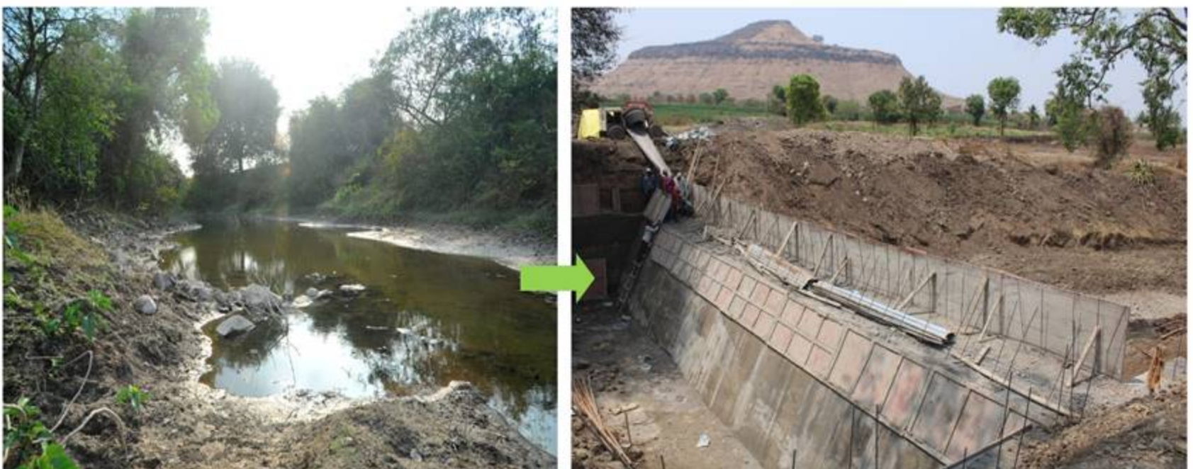
Construction of Cement Nala Bandhara

We are constructing Cement Nala Bandhara at Nigadi. This will help to make water available for agriculture and drinking and will benefit more than 800 villagers.