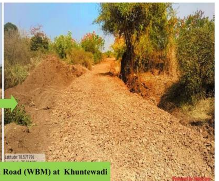
Construction of Panand Road (WBM) at Khuntewadi