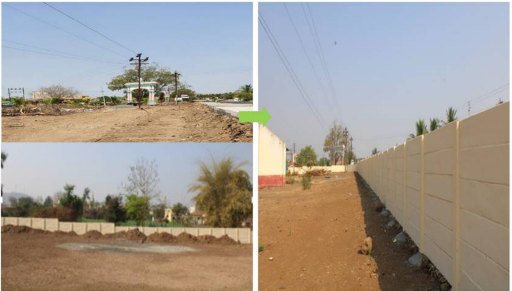
Constructed Compound /wall for ZP School at Nhavi budruk

For the safety of school and 150 school children we have constructed the Compound wall for ZP School at Nhavi budruk