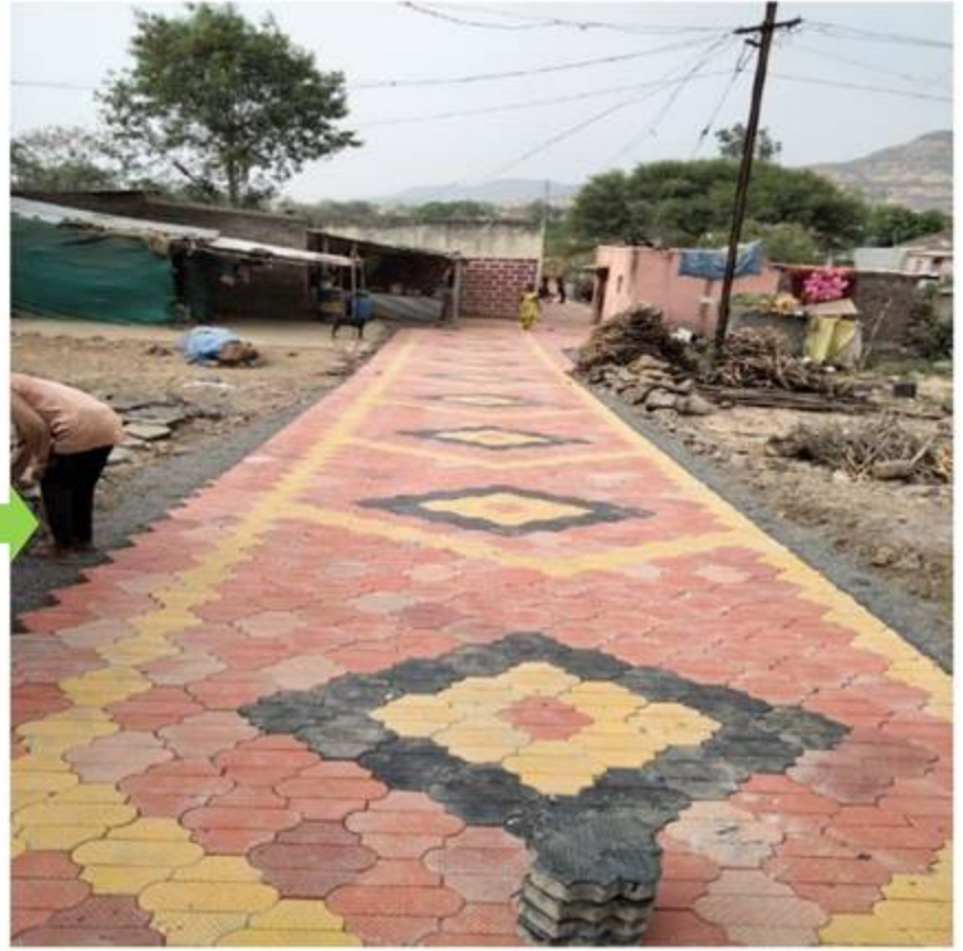
Construction of paver road at Belewadi