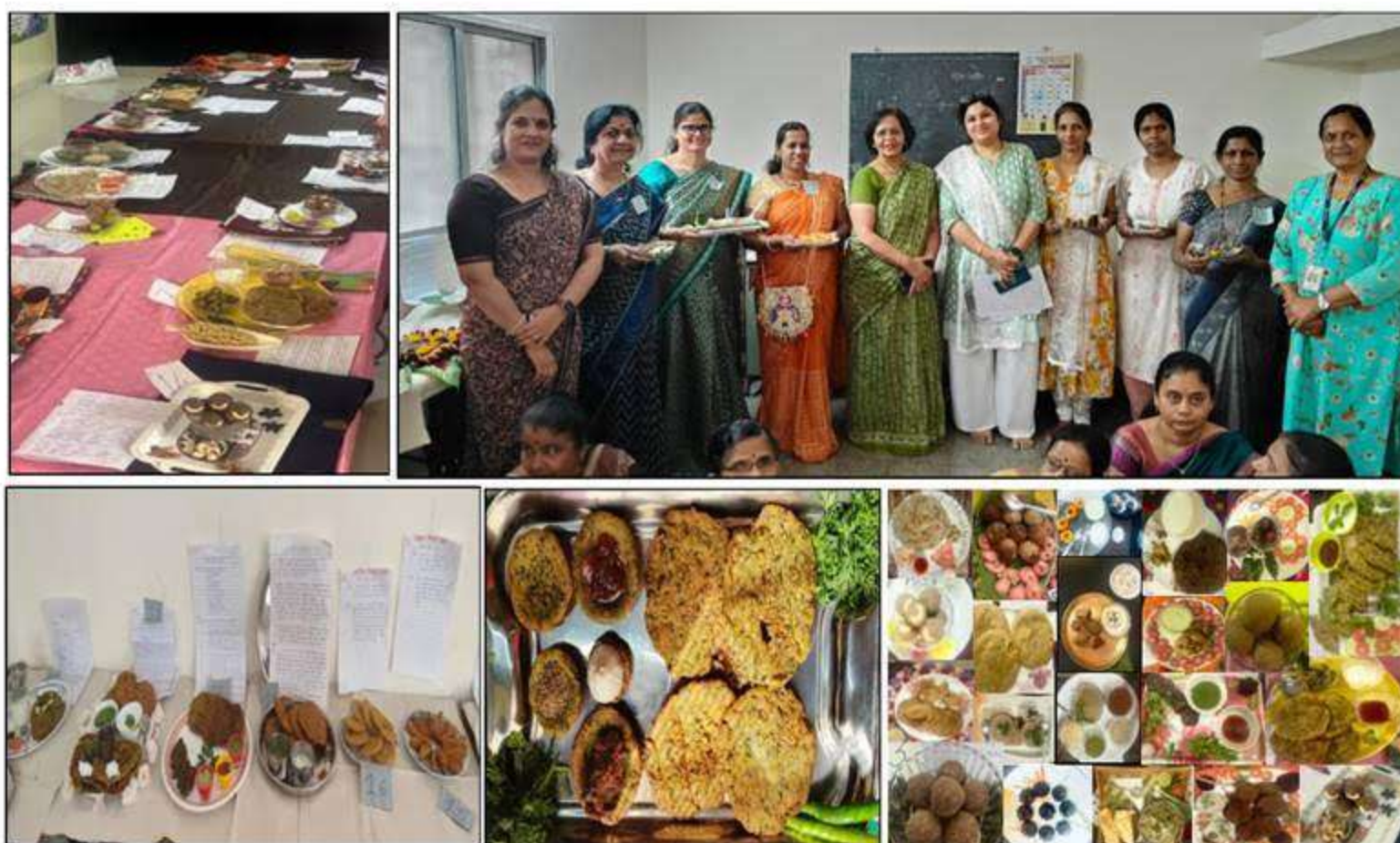
Cooking Competition 2024