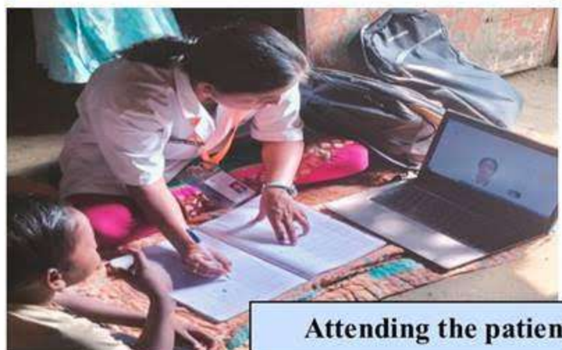
Attending the patient through outreach activities