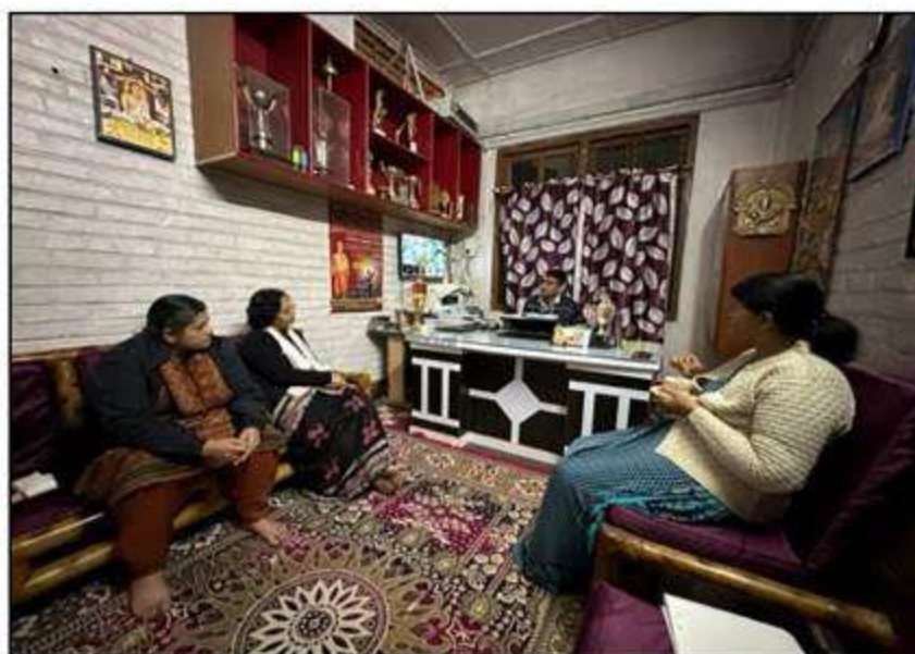
Interaction with the school staff at Majuli