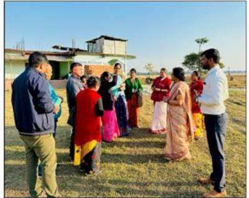
School visit & Interactions with the school staff & students at Sissiborgaon village.