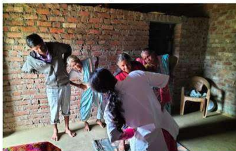
Physiotherapy session for the villagers