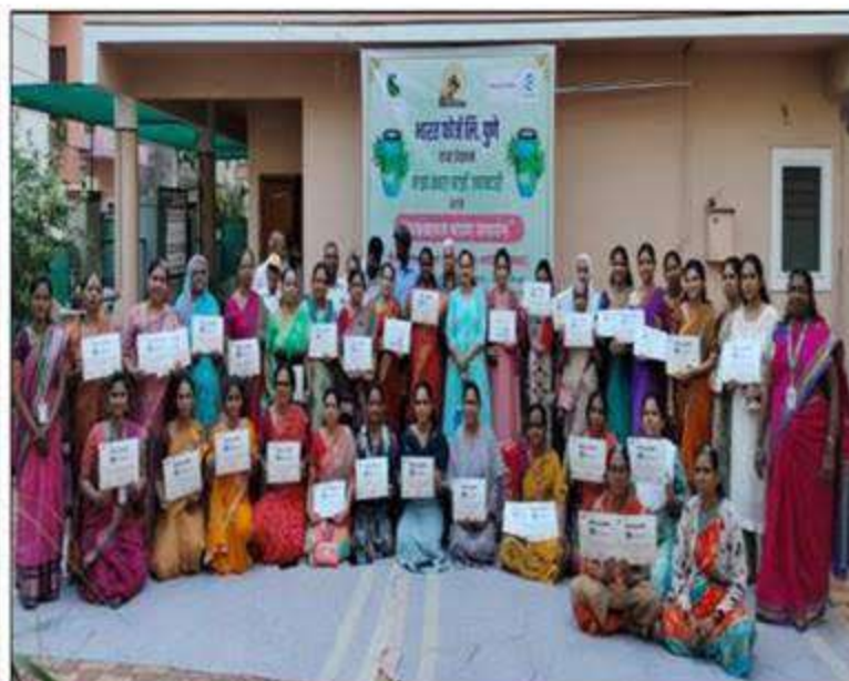
Gaikwad Society, Sayyad Nagar Hadap-