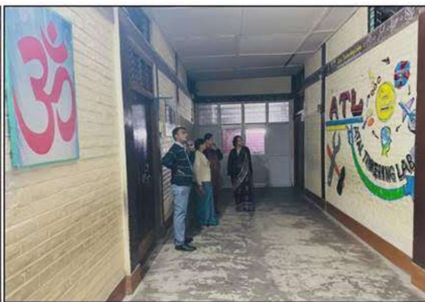
School visit at Majuli division.