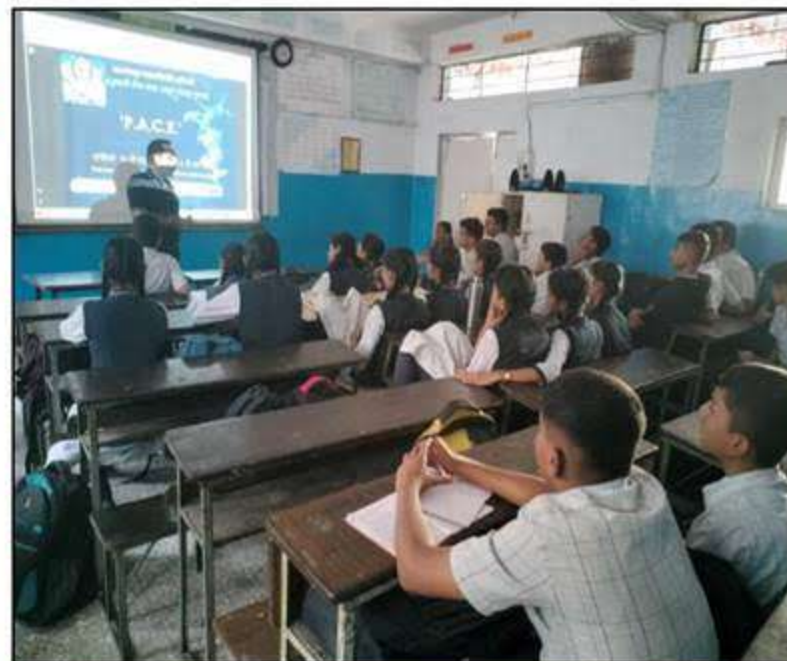
Sane Guruji Madhyamik Vidyalaya