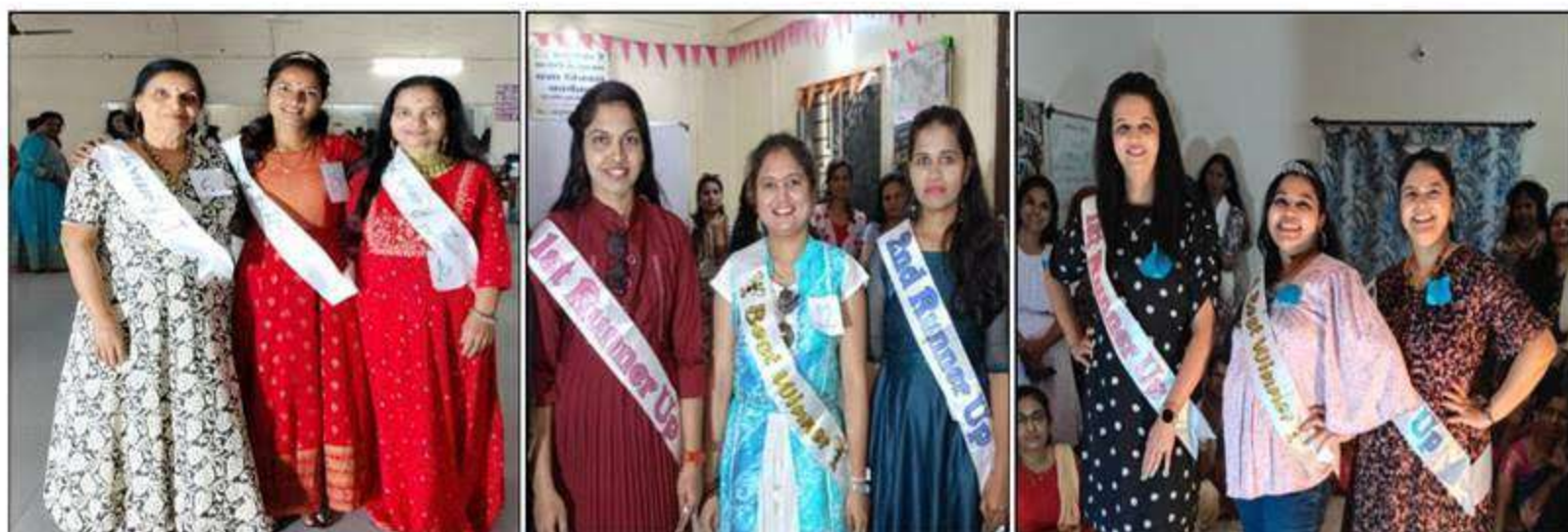
Fashion Show Competition 2024