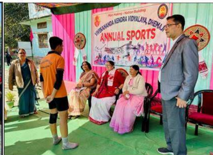
School visit & Interactions with the school staff & students at Dhemaji division.