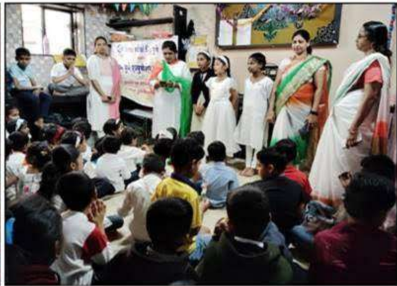
Celebrating Republic Day