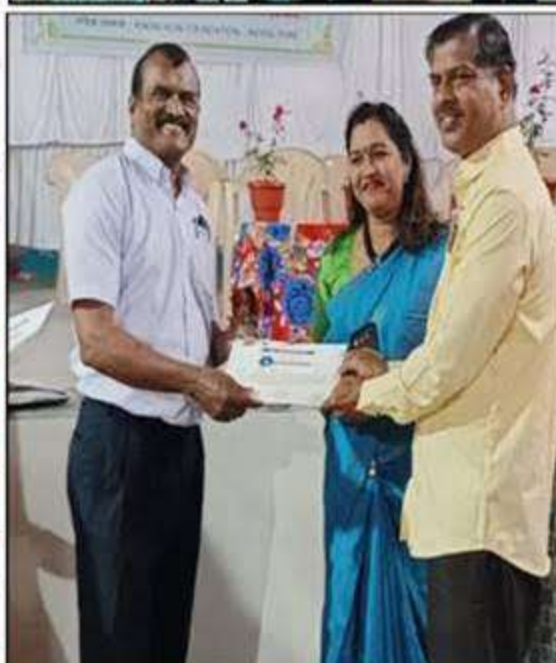
Employees from different departments felicitated the CP holders