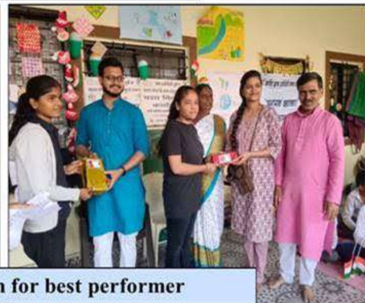
Prize distribution for best performer