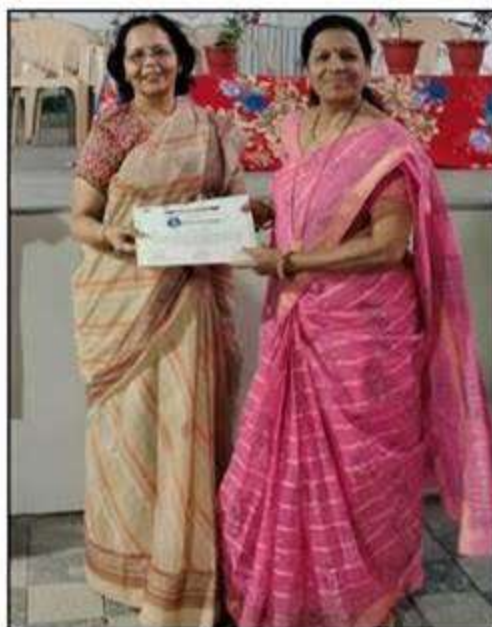
Certificate distribution to the CP Holder