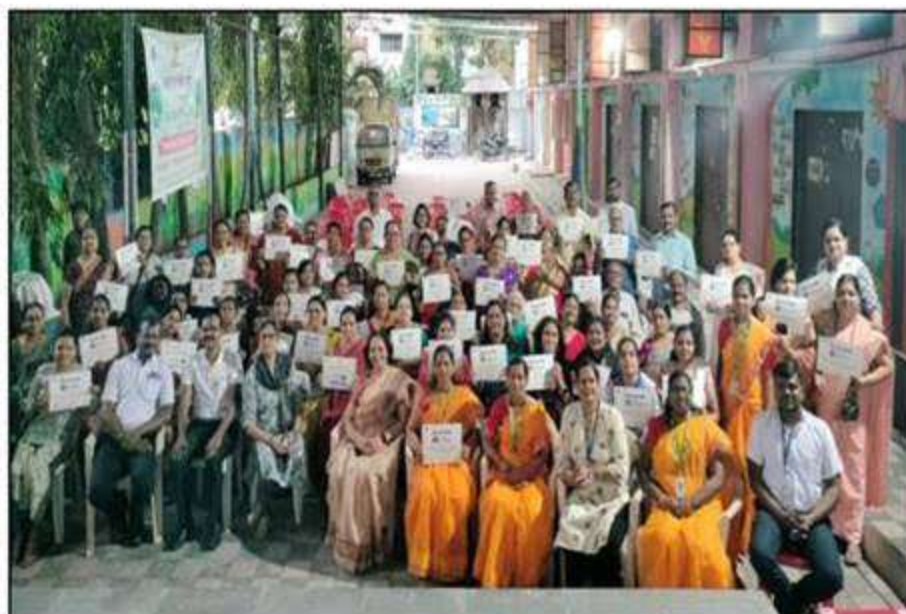
Sasane Nagar, Hadapsar