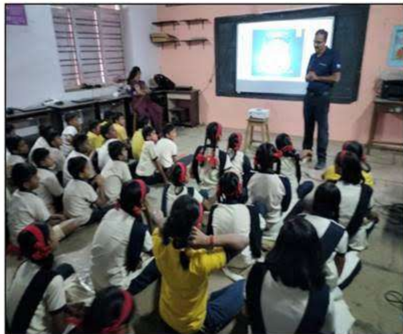
PMC Vidyaniketan School No 15