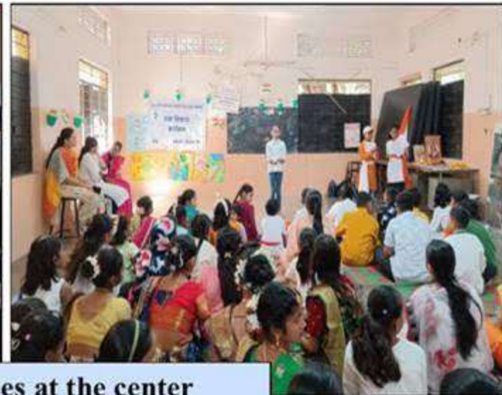
Dance performances at the center