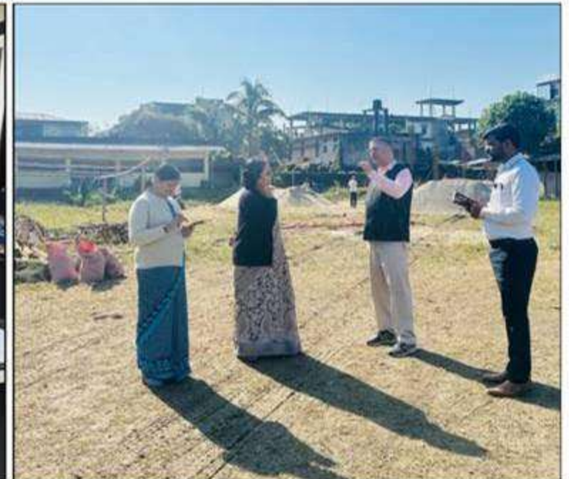
School visit & Interactions with the school staff & students at Dibrugarh division.