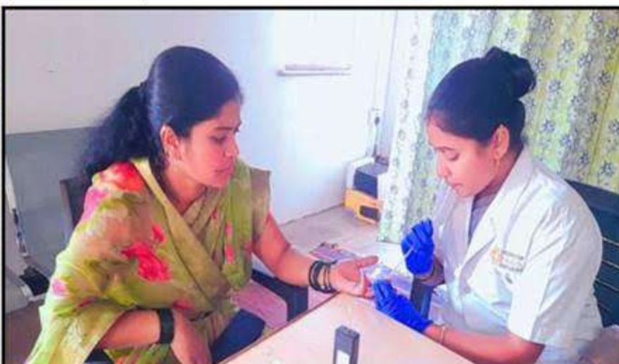
HB & BSL Testing