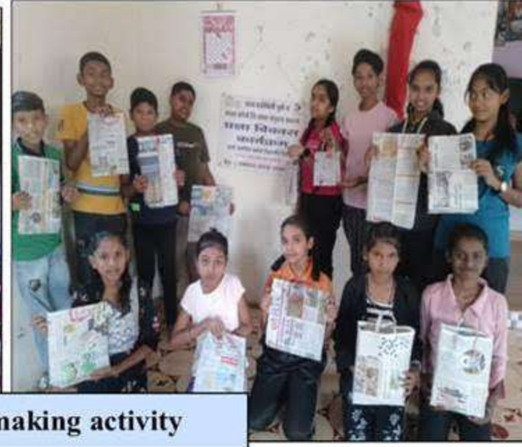
Paper bag making activity