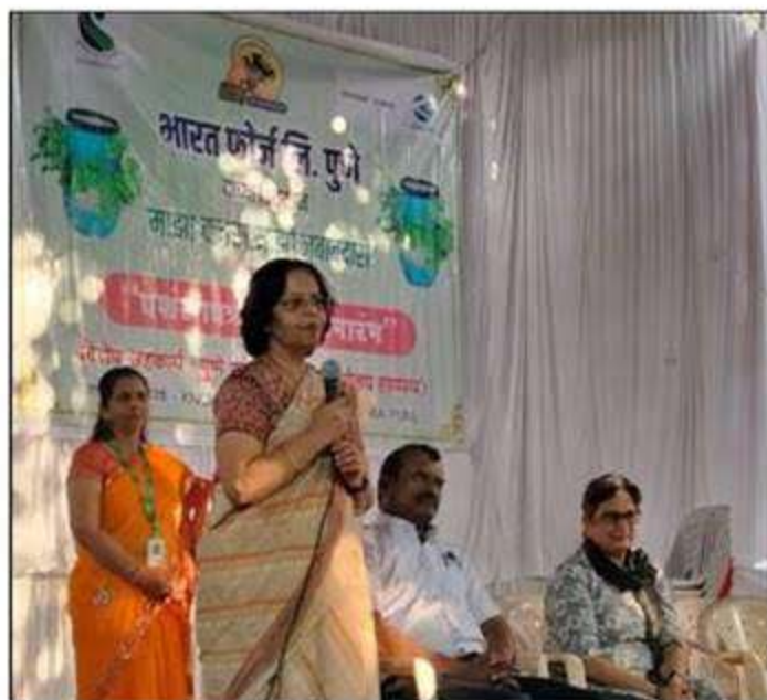
Interaction with CP Holders